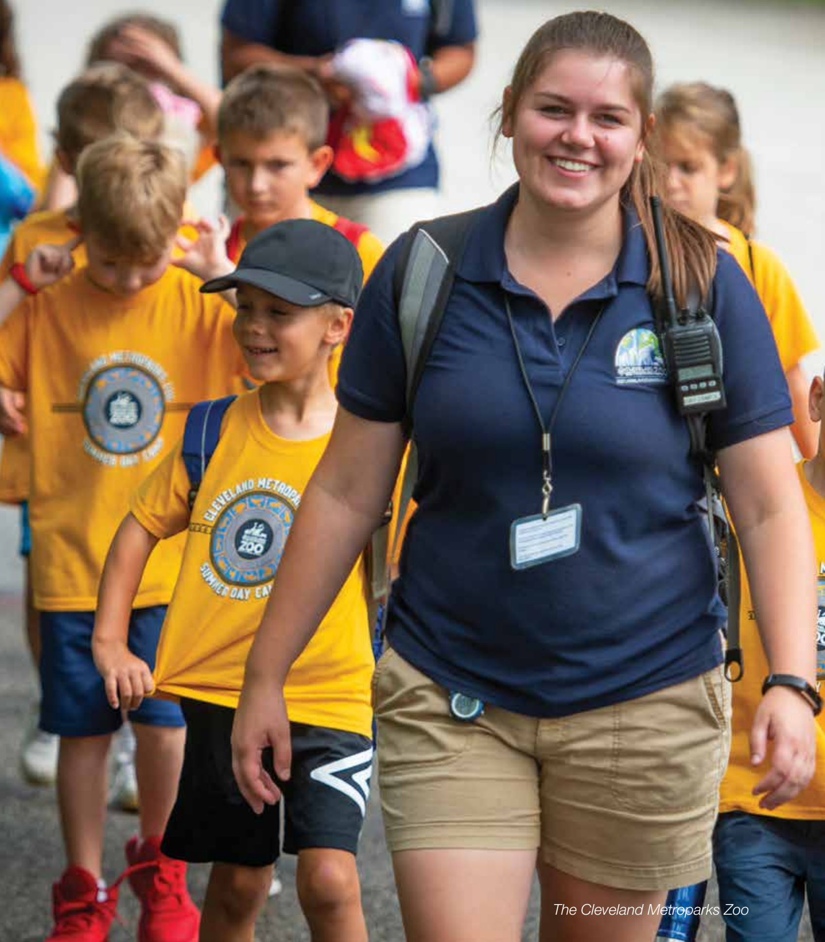
The Cleveland Metroparks Zoo