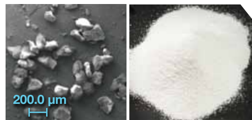
Carbopol 71G NF polymer (granular form)