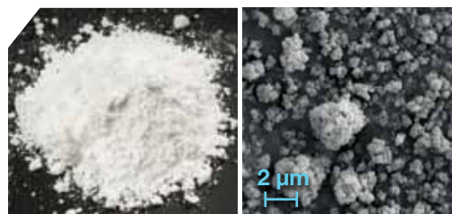
Carbopol 971P NF polymer (powder form)

The differences between Carbopol 971P NF polymer and Carbopol 71G NF polymer are particle size and density.