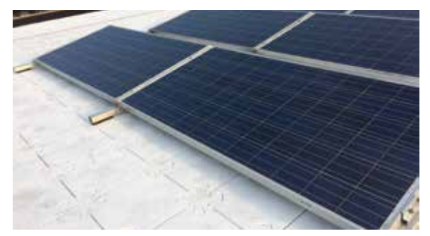
Solar panelling system installed on rooftop mounted with RoofClix panels.

The new RoofClix compound also delivers major savings to solar panel users: