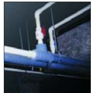
FlowGuard Gold® and Corzan® pipe & fittings