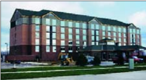
Hilton Garden Inn franchise hotel in Romulus, Michigan

The Detroit Hilton Garden Inn offers some unique benefits to guests, including a quieter, more reliable plumbing system and fire sprinkler protection that is manufactured for years of worry-free performance. The selection of an all-CPVC system, including a FlowGuard Gold® and Corzan® CPVC plumbing system and a BlazeMaster® CPVC fire sprinkler system, made from CPVC manufactured by Lubrizol, Inc., creates a total plumbing and fire sprinkler solution that ensures the safety and comfort of guests.